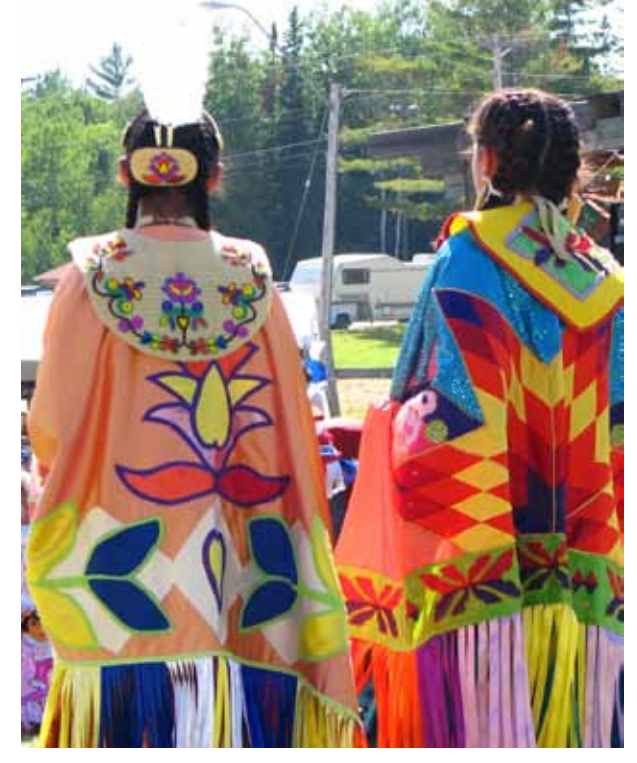
to occur while promoting acceptance and a greater understanding of the community and people they serve. Encouraging workers to incorporate their personal families with community events will allow for the

and STS are interrelated in child welfare work with Native families is the core to developing possible solutions. In order to work effectively in Native communities, it is essential that social workers are well prepared